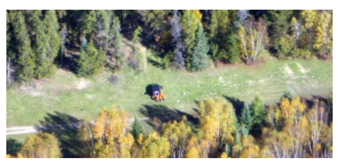
Turns out these hunters were not one of the targets.

The Manitoba crew consisted of spotters Grace