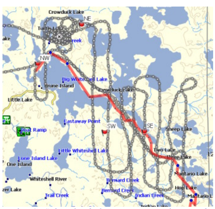
In this GPS download, the Mantario Trail is in red, the boundaries of the RCMP requested search area are the red flags marked NW, NE, SW, and SE, and the aircraft track, showing very straight lines for the middle of the night, is in grey. The map depicted here is only 11 nm across.

when I went from the dimly lit GPS to outside. I know some navigators who can do this solely by map reading but I found reassurance by the actual numbers.